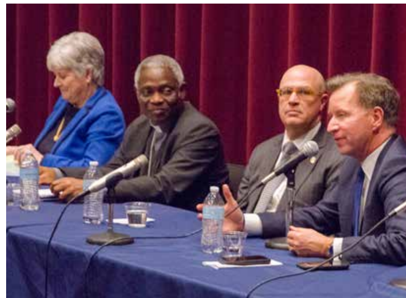
ons on March 21. LEFT: Cardinal Turkson listens to a panel discussion on ei answers an audience question at the public symposium on March 20.

Funding for the public symposium of “Financial Markets and Moral Inquiry” was generously provided by the Our Sunday Visitor Institute, which is supporting an effort by Lumen Christi to reach “the nones” (religiously unaffiliated persons, especially of the millennial generation) at the University of Chicago. Polling numbers suggest that an increasing number of young Americans, including former or non-practicing Catholics, do not understand Catholicism to be capable of sustaining them and giving them meaning amid the exigencies of modern life. Consequently they labor under misconceptions about the nature of Catholic teaching and practice, presuming the Church to be irrational, authoritarian, and antagonistic toward the ethos of a globally connected world. “Financial Markets and Moral Inquiry,” as well as being an important chapter in Lumen Christi’s Program in Catholic Social Thought, is an effort to help manifest the richness of the Catholic intellectual tradition to a broad public.