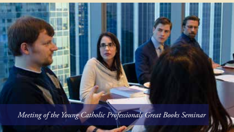
Meeting of the Young Catholic Professionals Great Books Seminar

Young Catholic Professionals intends to host another seminar cycle in 2020. Registration information for that seminar will be available on the group's website.