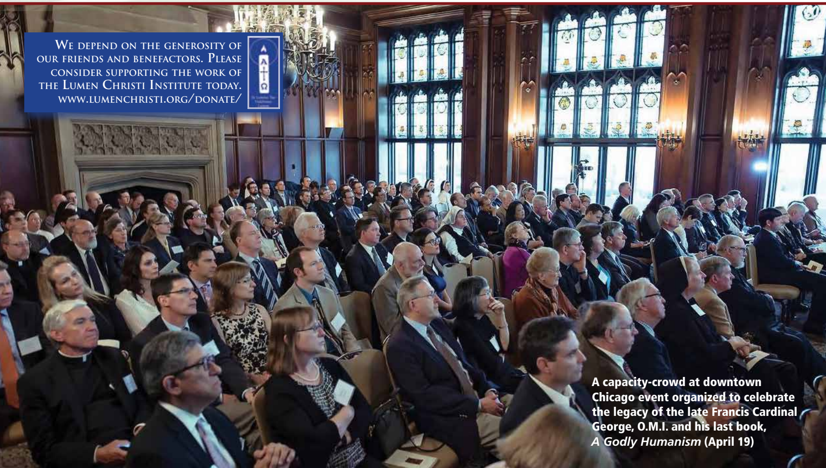
A capacity-crowd at downtown Chicago event organized to celebrate the legacy of the late Francis Cardinal George, O.M.I. and his last book, A Godly Humanism (April 19)