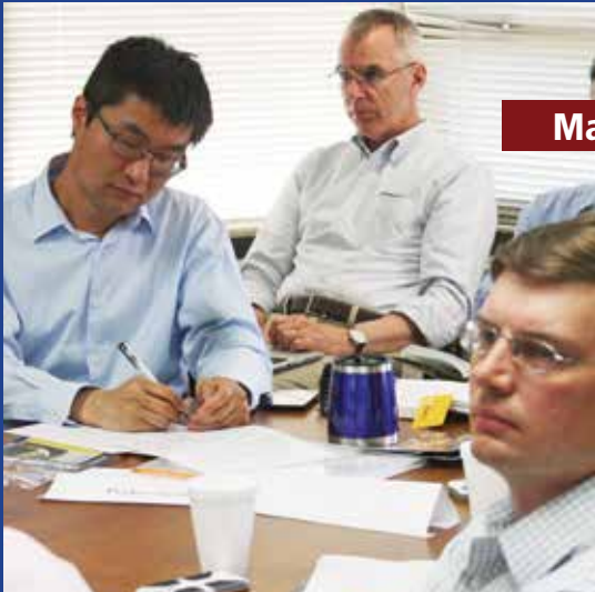
Fifteen graduate students and junior faculty in Economics and Finance attended an inaugural seminar on Economics and Catholic Social Thought at the University of Notre Dame. The event was cosponsored by the Catholic Research Economists Discussion Organization and the Notre Dame Center for Ethics and Culture