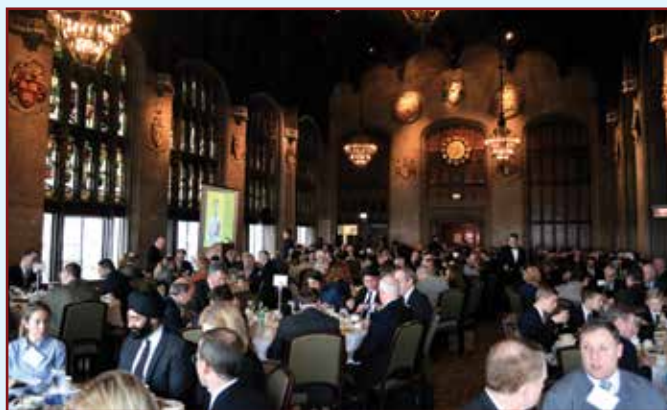
An audience of over 200 in Cathedral Hall at the University Club of Chicago