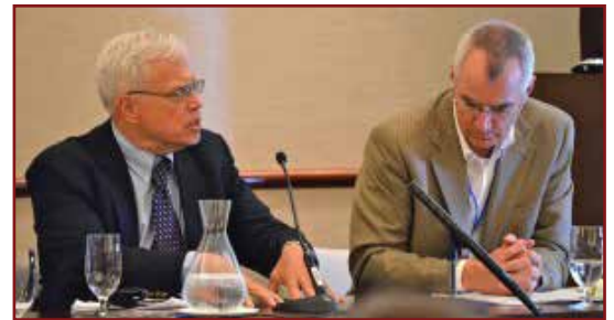
James Heckman (University of Chicago) discusses Skills Problem