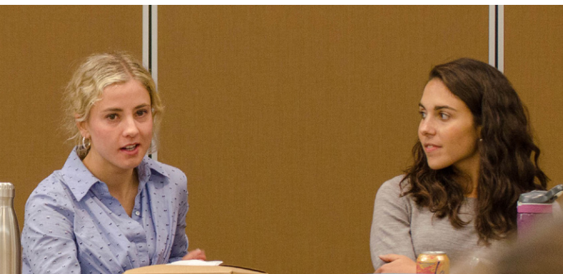
Students interact at Lumen Christi Institute-Catholics at Booth co-sponsored events in fall 2018.