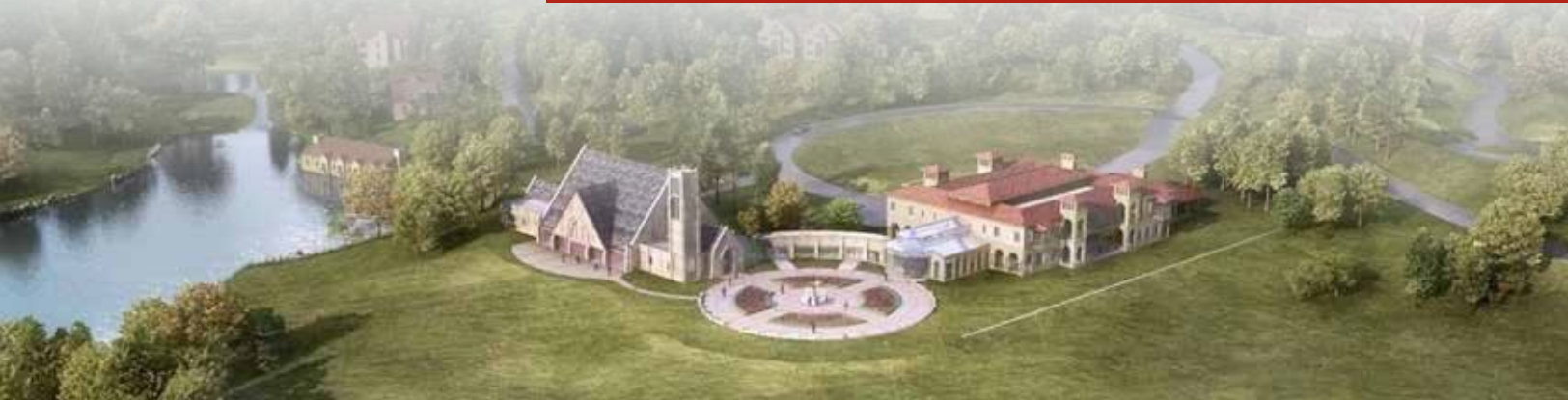
A rendering of The Cloisters on the Platte, expected to open in 2018.

"HERE IS A MAN WHO REACHED THE PINNACLE OF BUSINESS SUCCESS AND, THROUGH IT ALL, REMAINED TRUE TO HIS CATHOLIC FAITH ... WHAT AN EXCELLENT EXAMPLE FOR ME AND OTHER YOUNG CATHOLICS OF THE TRANSFORMATIVE POWER OF FAITHFUL WITNESS TO CHRIST."