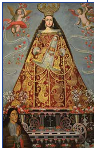
Unknown Artist, Our Lady of Bethlehem with a Male Donor , 18th century. Carl and Marilyn Thoma Collection.