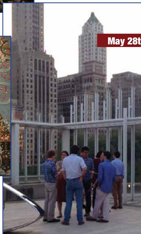
Students discuss the exhibit and admire the Chicago skyline after dinner on the veranda at the Art Institute of Chicago