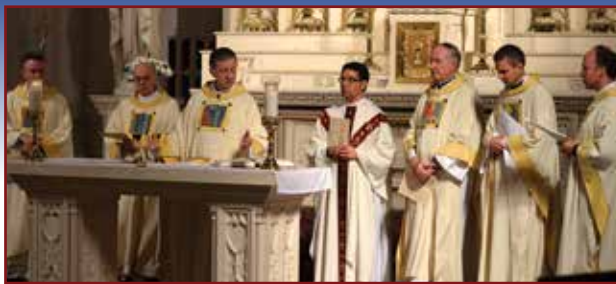
Archbishop Blase Cupich (Chicago) with fellow bishops and priests prior to the Mass in St. James Chapel at the Quigley Center (May 1)

Topics covered at the May 1st conference which took place at the Hilton Chicago/Magnificent Mile Suites included “Catholic Social Thought and the Family,” “Vulnerable Families and their Children in the Changing Economy,” “Marriage in the Modern Economy,” and “The Role of Families in Later Lives.”