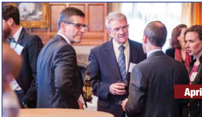
Reception in Quadrangle Club following the symposium on "The Family in the Changing Economy"