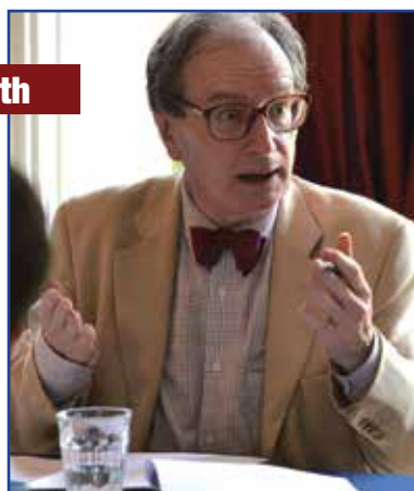
Jean-Luc Marion leads a master class for graduate students on "Seeing and Being Seen: A Reading of Nicholas of Cusa's The Vision of God "