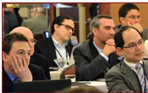
Attentively listening during the second day of the “Family in the Changing Economy” conference (May 1)

The April 30th symposium on “The Family in the Changing Economy” was part of the Seventh Annual Conference on Economics and Catholic Social Thought, a two-day conference (April 30-May 1) which brought