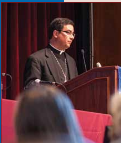
Bishop Oscar Cantú (Las Cruces, NM) keynotes at Apr 30th symposium

NEWSLETTER OF THE LUMEN CHRISTI INSTITUTE FOR CATHOLIC THOUGHT SUMMER 2015