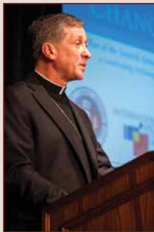
Archbishop Blase Cupich (Chicago) gives opening remarks at symposium on "The Family in the Changing Economy" (April 30)

Archbishop Cupich presented the problems facing families today. "There are many features of American culture in this historical moment that make genuine family life extraordinarily difficult and, at times, seemingly impossible. A pervasive materialism fuels a frantic consumerism. People are then defined—and they define themselves—in the measure that they can acquire things." Not only do families feel pressures that drive them to unnecessary despair, "government or business policies can further strain family time and resources. Human needs and personal dignity are too often irrelevant in an economy driven by cost-cutting, stock holders' expectations, or a bottom line that