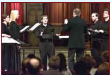
Schola Antiqua of Chicago

The Schola Antiqua of Chicago—Artists-in-Residence at the Lumen Christi Institute—were mentioned in The New York Times ArtsBeat section on June 7th in connection with their New York City debut at The Morgan Library & Museum planned for June 2014.