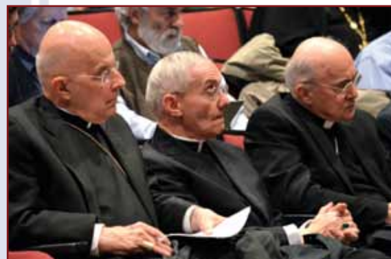
Francis Cardinal George, O.M.I. (left), Cardinal Tauran, and Papal Nuncio Archbishop Carlo Maria Viganò at Pacem in terris symposium (April 4)