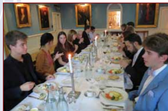
Oxford seminar closing dinner in Champneys Room at Oriel College