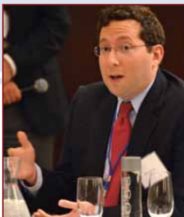
At downtown conference on "Toward a Moral Economy" (May 24)