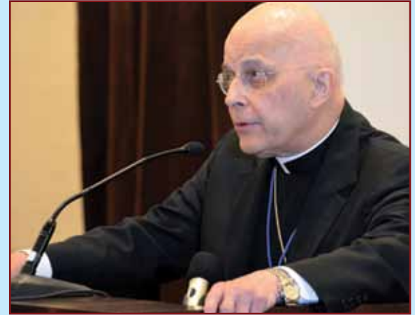
Francis Cardinal George, O.M.I., Archbishop of Chicago, delivers a talk on Globalization and Catholic Social Thought at downtown conference on “Toward a Moral Economy” (May 24th)

“Let people of good will collaborate in developing and humanizing our global world so that it be worthy of the One who created it and saw that it was good.”