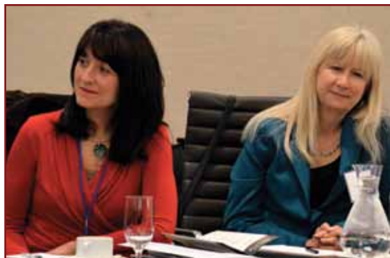
Participants at downtown conference on "Toward a Moral Economy" (May 24)