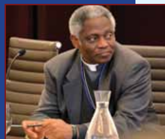
Peter Cardinal Turkson, President of the Pontifical Council for Justice and Peace