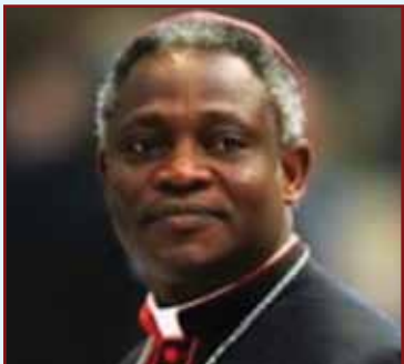
Peter Cardinal Turkson