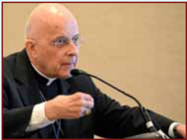
Francis Cardinal George, O.M.I., Archbishop of Chicago

Jean-Louis Cardinal Tauran—who in his role as Protodeacon in the 2013 conclave stood on the balcony of St. Peter’s Basilica and introduced Pope Francis to the world—was interviewed by the Chicago Tribune about the experience, but also about his role in interreligious dialogue. Tauran was visiting Chicago for the “ Pacem in terris : After 50 Years” symposium and conference (April 4-5).