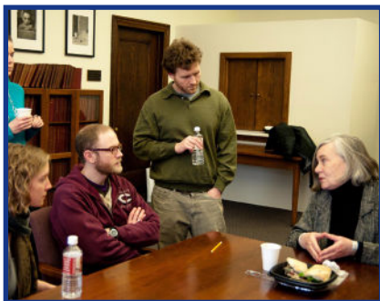
Marilynne Robinson with students at luncheon