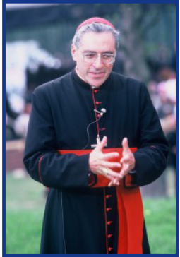
Cardinal Jean-Marie Lustiger, Archbishop of Paris (1981-2005)