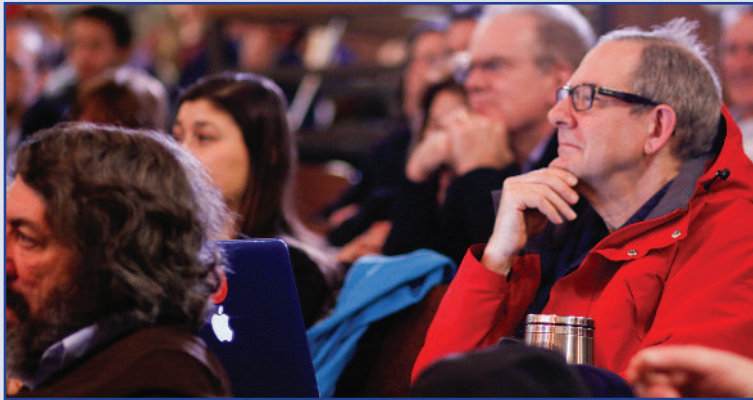
Audience members ponder "Evolution and the Catholic Faith"

Evolution, in a nutshell, is a theory of how atoms came to be assembled in certain ways to form biological organisms. At first glance, the theory doesn't appear very threatening.