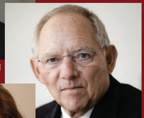
Dr. Wolfgang Schäuble