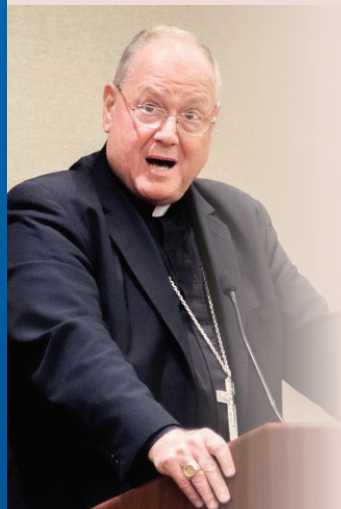
Timothy Cardinal Dolan

on December 15, 2015, that celebrated the book A Godly Humanism , which Cardinal George completed nine days before his death.