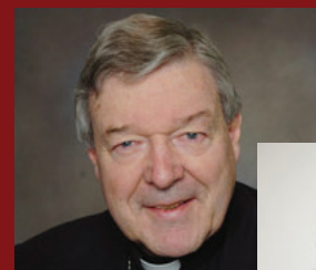
George Cardinal Pell

Lumen Christi will join eight other international institutions to co-sponsor this important event: Konrad-Adenauer-Foundation (Berlin); Markets, Culture and Ethics – Research Centre of the Pontifical University of the Holy Cross (Rome); IESE (Barcelona); Chair of Business Ethics; The Catholic University of America (Washington DC); Pontificia Universidad Católica de Chile (Santiago de Chile); Katholische Sozialwissenschaftliche Zentralstelle Mönchengladbach; and Universidad de Navarra, Facultad de Economía (Spain).