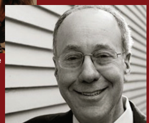
Prof. Roger Myerson