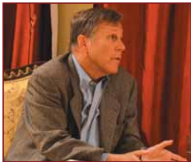
Dana Gioia reads a selection of his poems at Gavin House the evening of October 17th

“What beauty gives us,” he said, “is a mysterious joy, beyond the power to possess.” It gives us also a heightened perception of the shape or meaning of things. The vision may be disturbing, as in a hawk swooping down on its prey, but it is connected to a sense of the truth.