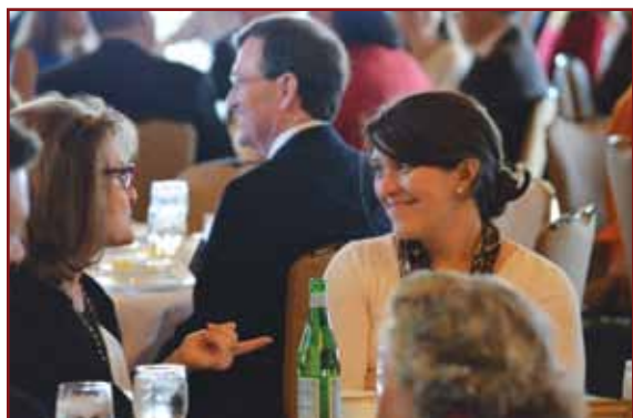
Guests engage in conversation at luncheon prior to Dana Gioia's talk on "Why Beauty Matters" (Oct 17)