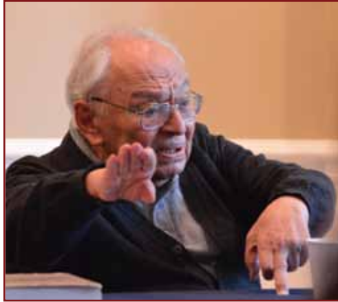
Peruvian Theologian Gustavo Gutiérrez

“For Aquinas, charity was at the center of ethics.”