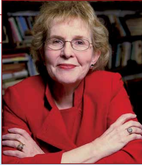
Jean Bethke Elshtain