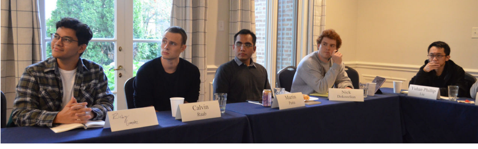
This autumn, graduate students gathered at Gavin House at least three times a week for reading groups, master classes, seminars and social events, learning from world-class professors and building a unique community at the university.