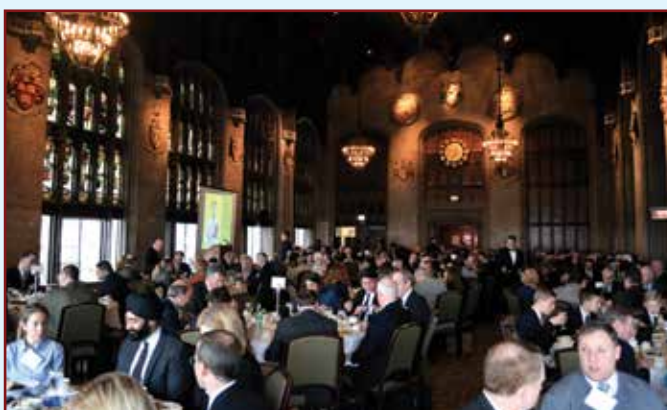
An audience of over 200 in Cathedral Hall at the University Club of Chicago