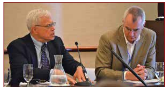
James Heckman (University of Chicago) discusses Skills Problem