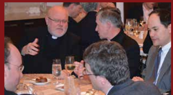
Blase Cupich visited Chicago for the 2012 Economics and Catholic Social Thought Conference titled, “Toward a Moral Economy: Policies and Values for the 21st Century.”

Cupich visited Chicago in 2012 (then Bishop of Spokane, Washington) to attend the fifth annual Conference on Economics and Catholic Social Thought. The theme of the conference was “Toward a Moral Economy: Policies and Values for the 21st Century,” and was sponsored by the Lumen Christi Institute, The John U. Nef Committee on Social Thought at the University of Chicago, and the leading German center for Catholic social thought (the Katholische Sozialwissenschaftliche Zentralstelle or KSZ).