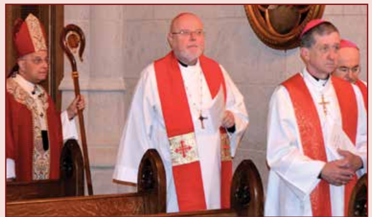
Francis Cardinal George, O.M.I., Reinhard Cardinal Marx, and Blase Cupich at an early morning Mass at Saint James Chapel in the Archbishop Quigley Center (June 1, 2012). Afterwards, economists, bishops, and theologians gathered at the Park Hyatt to further discuss topics relating to “Toward a Moral Economy: Policies and Values for the 21st Century.”