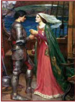
Tristan and Isolde

Gnostic heresy taught European literature its rhetoric of passion