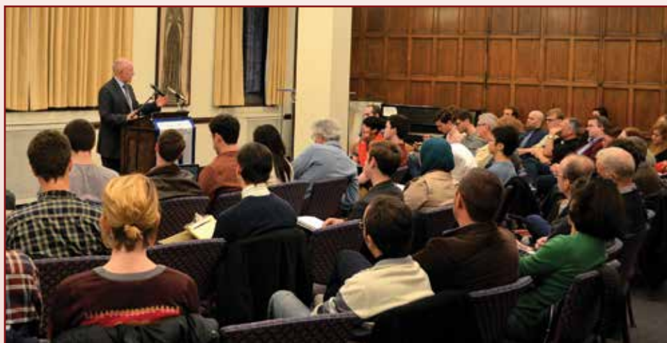
Rémi Brague gives a lecture on “The Necessity of Goodness” (Nov 5), arguing that the concept of good is broader than just morality

Brague attributes his broad base of knowledge to the outstanding education he received in France. As a teenager, in preparation for the rigorous Grande École exam that determines whether students can enter one of the prestigious higher education establishments in the country, he “really had to work like several beavers,” he joked. He had to have a grasp of classical languages, philosophy, history (modern and ancient), and French literature, which gave him “a glimpse of the whole landscape” and provided him with an intellectual roadmap. “I knew where things are to be looked for,” he said of the result of such extensive study. He was fortunate to be accepted into the École Normale Supérieure, which was founded in 1793 and has since become a platform for many of France’s brightest young people to pursue high-level careers in government and academia. Brague attended École Normale Supérieure along with French philosopher Jean-Luc Marion (Marion is a year older than him). Afterwards, he pursued doctoral studies at the Université Paris-Sorbonne (Paris IV) where he was required to focus a bit and concentrate on a definitive field (he chose to write his dissertation on Plato).